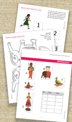
Printable Activity Sheets