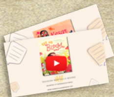
Flipbook Videos & Educational Slideshows