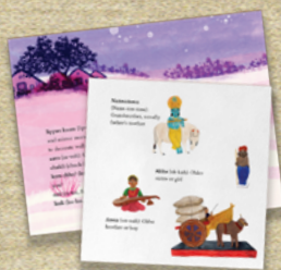
Pronunciation Guides, Author Notes, & More

yalibooks.com/resources modernmarigoldbooks.com/guidesandresources